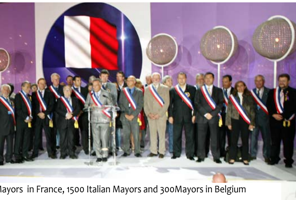
Mayors in France, 1500 Italian Mayors and 300 Mayors in Belgium