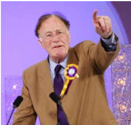
LORD CORBETT OF CASTLE VALE

Chair, British Parliamentary Committee for Iran Freedom