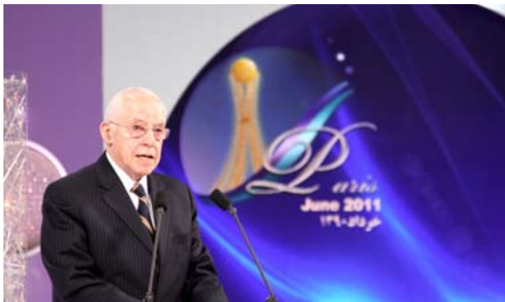
MICHAEL MUKASEY , US Attorney General (2007-2009)

// You speak with one voice and that voice is heard to Tehran. //