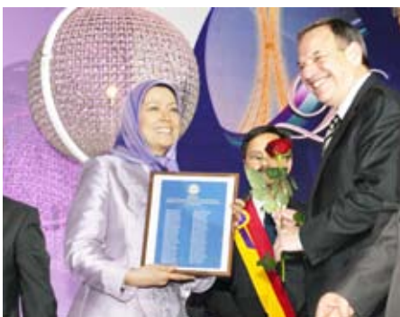
Representative Bob Filner and support of U.S. Congress