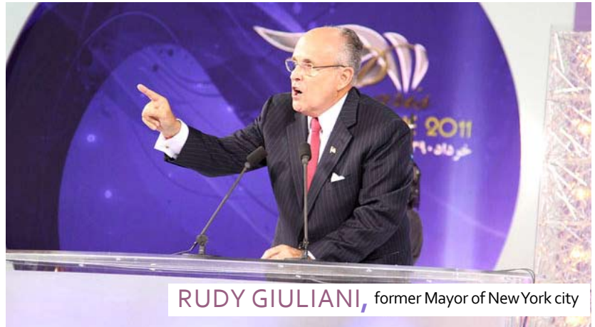
RUDY GIULIANI , former Mayor of New York city

He considered terror tagging the Mojahedina "mistake