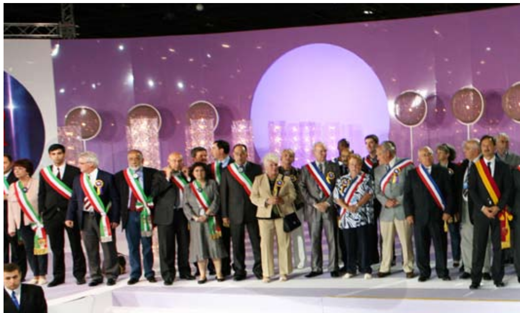
Mayors and Elected Officials rally to present the support of 5500 M

We need to double our efforts to eliminate this shameful label, manufactured, among others, by Judge Bruguière and the government prompted him to do that, on behalf of the mullahs against the People's Mojahedin.