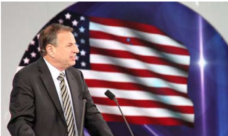
BOB FILNER , Member of US Congress

“ We should immediately remove PMOI from the list. We must recognize this historical mistake which was rejected by the EU, the UK, and here in Paris, as it is used as an excuse for murder. ”