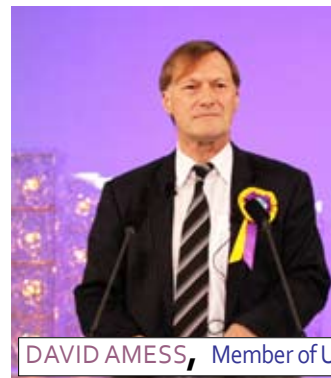
DAVID AMESS, Member of U.K. Parliament

The delegation of the European Parliament , which has a leading role in defense of Ashraf, led by the Vice-President Alejo Vidal-