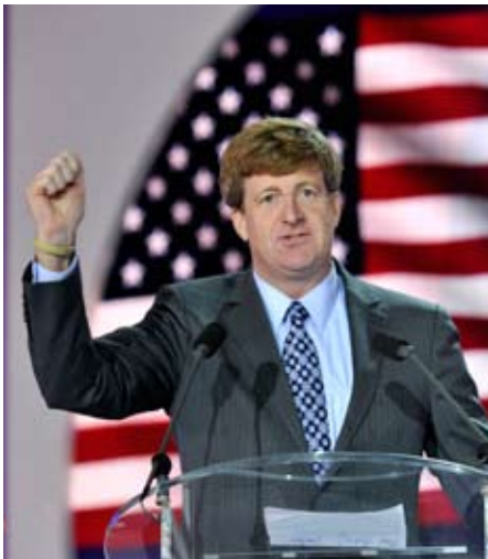
PATRICK KENNEDY , member of US Congress(1995-2011)