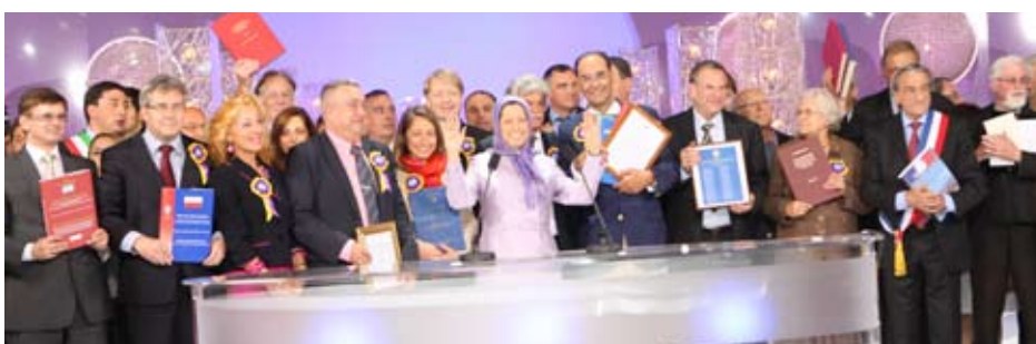
Delegations of European Parliament and American February Frist