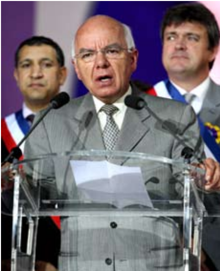
JEAN-PIERRE BRARD, MP

On behalf of the French Parliament, for a secular and democratic Iran, I just like to express the support and solidarity of the majority of French parliamentarians. Solidarity in struggle as you lead Iran to get rid of dictatorship, tyranny and religious fascism.