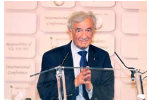
Message by Elie Wiesel Nobel Peace Prize Laureate

Patrick Kennedy announced that: We just received a call from Elie Wiesel.