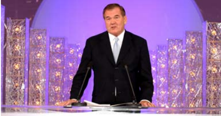
TOM RIDGE , US Homeland Security Secretary (2003-2005)

It's an extraordinary honour for me and a great privilege for my colleagues from the United States to have the opportunity on several occasions to work with an individual that we believe clearly is one of the most inspirational, great leaders of the 21st century. "Viva, Maryam."