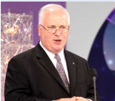
JOHN BRUTON Former Prime Minister of Ireland

"I say as a European, and a proud European, that the European Union should cease to give all financial and technical assistance to the government of Iraq until it allows the people at Camp Ashraf to be free."