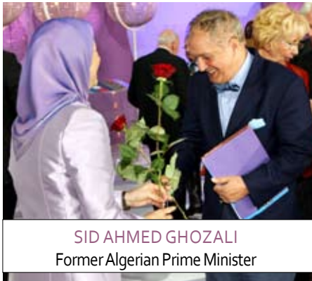
SID AHMED GHOZALI Former Algerian Prime Minister