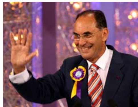
ALEJO VIDAL-QUADRAS Vice-President of the European Parliament