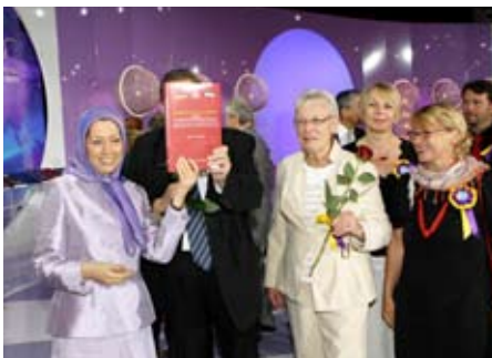
The German delegation presents the support of members of the Bundestag