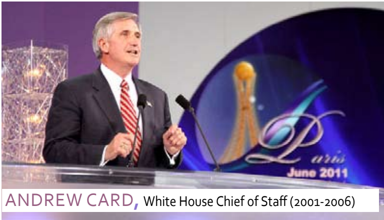
ANDREW CARD, White House Chief of Staff (2001-2006)

This gathering is empowering to the people who pray and want to bring democracy to Iran. It is also a great reflection of support for the people of the MEK. It is truly time, it is truly time for the people all over the world who care about democracy to stand with the Iranian people and the MEK in the struggle for democracy.