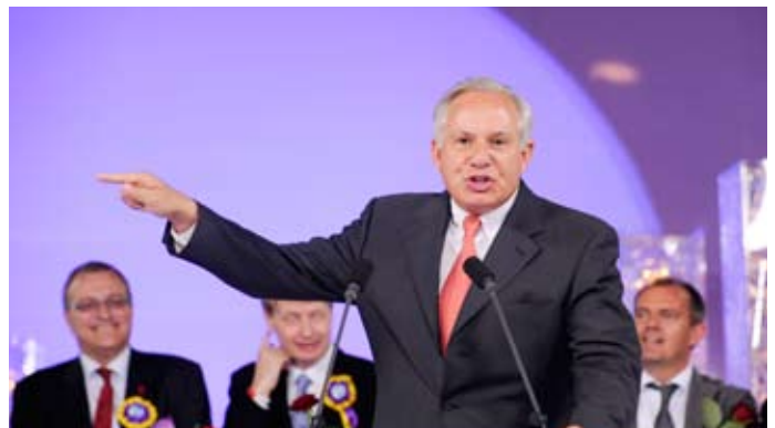
ROBERT TORRICELLI , Former Member of US Senate

"Men and women of Ashraf, you are the first heroes in the new revolution for democracy in Iran. You are our heroes, Camp Ashraf. Always remember it and we stand with you. "The Persian people are too proud, their culture is too rich, their history is too long to have their dignity and their freedom stolen by some cheap dictators who have stolen their faith and stolen their history. Your time is up. We're coming for you.