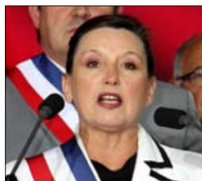
NELLY ROLAND IRIBERRY, Mayor of Villepinte

I am pleased to welcome you today to the city of Villepinte.